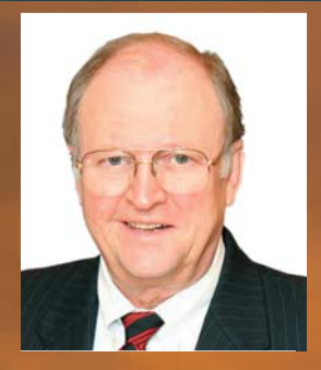
Legacy Award Honoree: The Honorable Bill Armstrong

Accept the challenge from today's most recognized conservative national speakers if you're serious about carrying the torch of freedom in public policy, politics or industry.